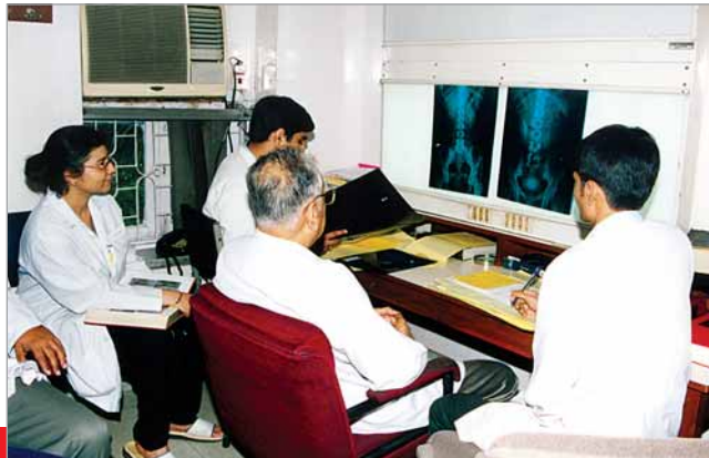
A combination of youth and experience - delivering excellence

Conventional Radiology is still the cornerstone of medical imaging and it constitutes the major bulk of investigations in imaging departments. The image of EKO was also built by its excellence in top quality X-Ray imaging. Recent introduction of Digital X-Ray has improved the image quality to a great extent and added the much needed flexibility in acquisition and processing of images. The radiation exposure is reduced by 20% approximately.